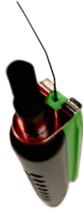
Wire between prongs