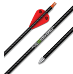
3K Carbon Fiber—.003